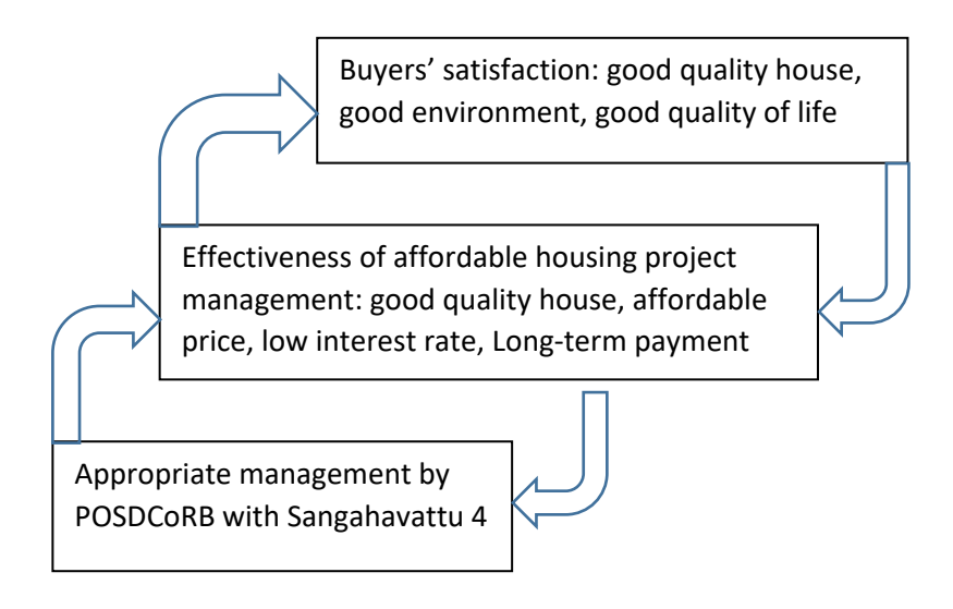
Figure 4.2 Synthesized body of knowledge

From this body of knowledge, it can be synthesized to simple synthesized knowledge as follow: