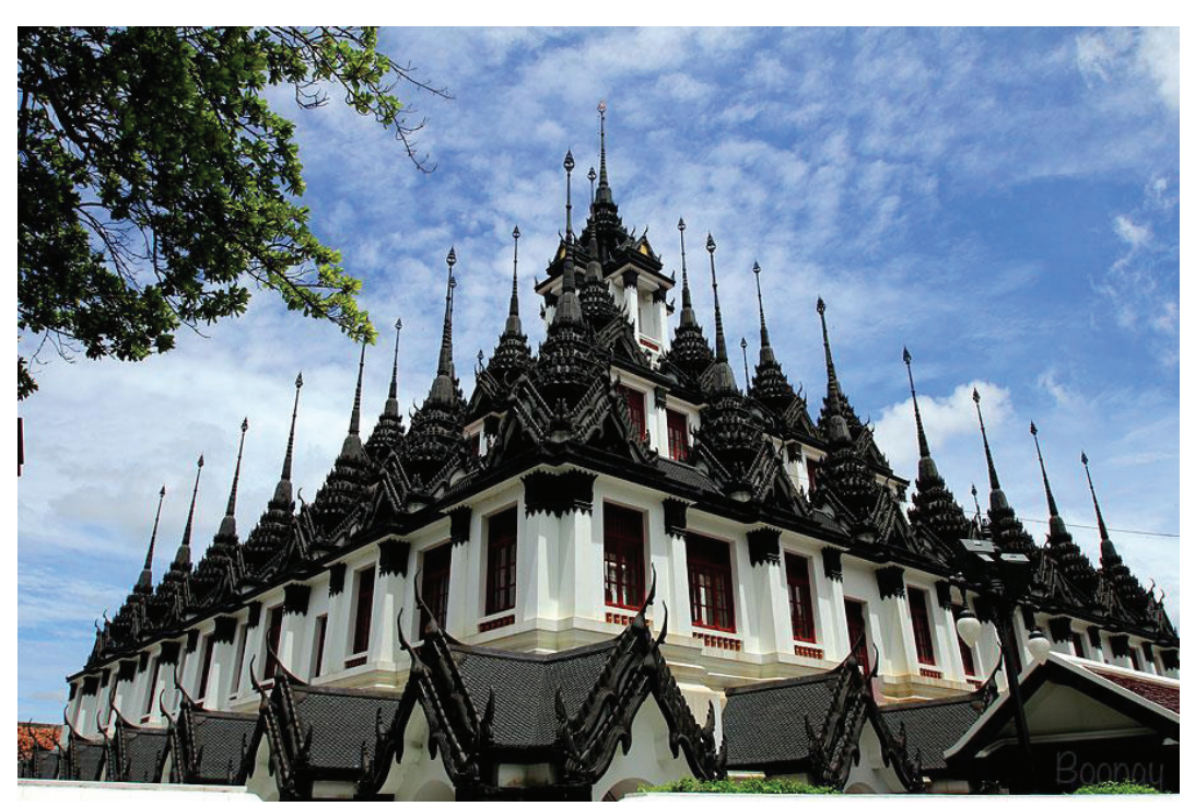
Figure 2 The Loha Prasat at Wat Ratchanadda in Bangkok, a multi-tiered structure 36 m. high and having 37 metal spires signifying the 37 virtues toward enlightenment

4. Easy to use (a week too) refers to the construction of a building or facility. Comfortable living It is best to take the workload and the need for it. Including both physical comfort. The need for the Cascades is truly suitable for use. In a week of her mind. The practice refers to places that need support to access to religious ideals, such as the construction conforms to the wild nature. As to the complementary principle. A place Rmnii Delightful for access or practice so the Buddhist community that could mean easier access. Not far from the city and community facilities such as bathrooms, waterfront, residential facilities suitable for the age and gender, as well as threatening the living conditions of practice. So what must create a design concept. The building is going to facilitate both in private practice and the principles of a climate conducive to the withering of the service users on what caused the other utilities.