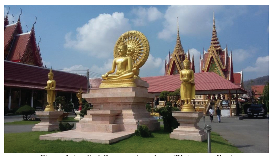
Figure 1 Applied Construction photo

5. Lack of knowledge of Discipline / legal means of Buddhist Monks, who served in the administration. infrastructure management No knowledge of the law school building, architectural or laws relating to the construction of places of worship in the temple, as the law remains. Law Building Or rules to other facilities in the building or not. As a result, the monks Buddhist Monks several criminal acts in ignorance. Knowledge and discipline. Applied to the media that reflect the principles of Buddhist teachings to maintain or preserve the ideals of Buddhism them. It creates a form of public appearances principle was not reached. The construction was not an audit work, the law will affect purity. Transparency, accountability Buddhist Monks so many people have been prosecuted in the budget. The budget and the construction of a wrong plan and so on.